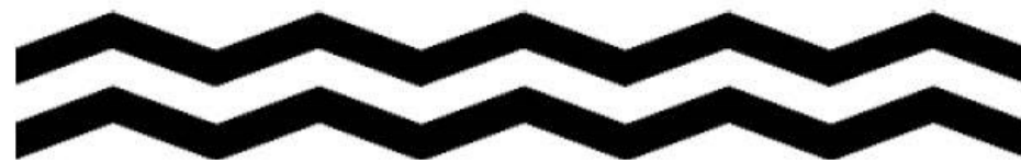
ZIG ZAG LINE